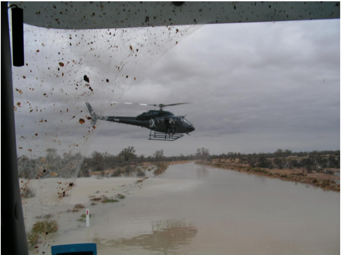
The ABC Helicopter film crew filming us as we returned with our 2nd group of 13 pax from Cowarie Station back to Marree at 4.30pm - 7 hours Later.

We drove from Marree to Cowarie Station, halfway up the Birdsville Track with 13 pax, half our group and had crossed the Cooper Creek where it flows across the track in a width of approx. 2kms.